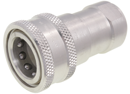
性能 (Performance) 测试流体: 油-200SUS (Test Fluid: oil-200SUS)