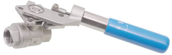
PRESSURE TEMPERATURE RATINGS (BODY)